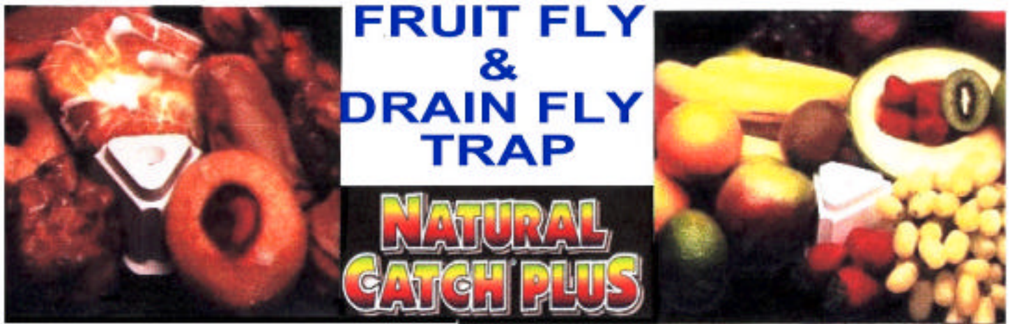
Typical use in Bakery Departments