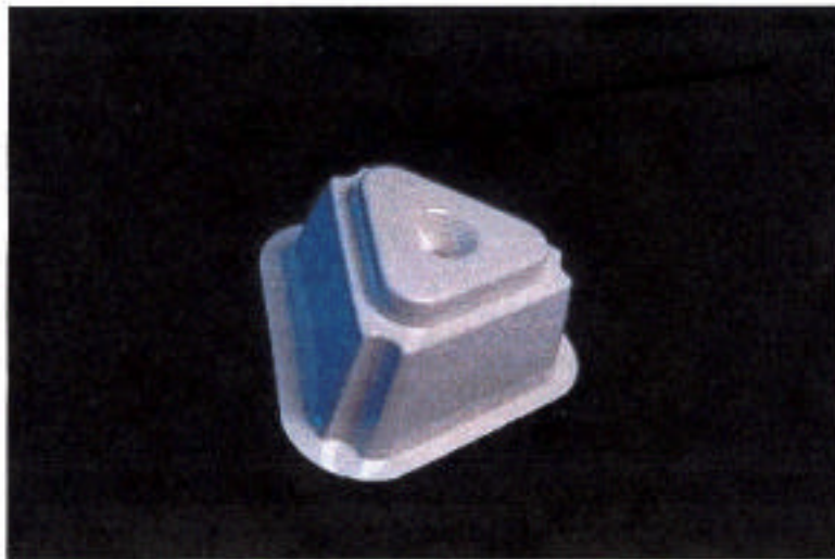
Typical use in Produce Departments